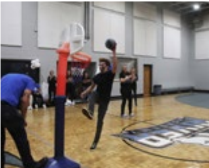
Pep rally and basketball game — undefeated, championship season!