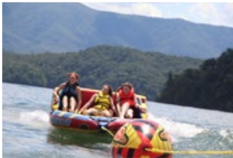
Fun at the lake