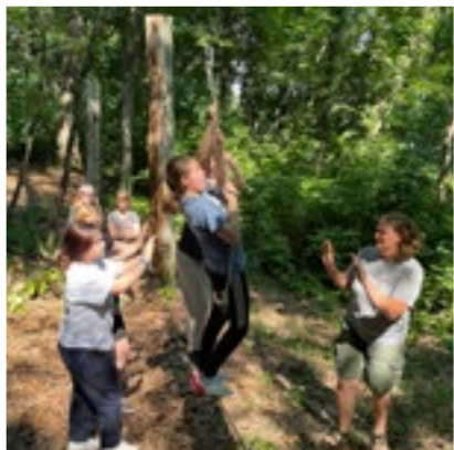
Summer camp week